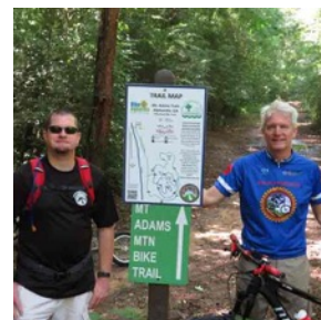
Mt. Adams Signage