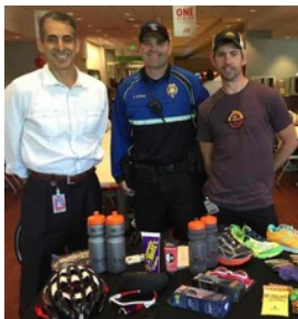
ADP Health Fair